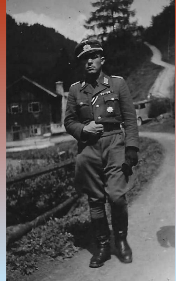
Russian captured in German uniform