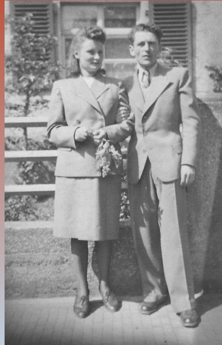
Azordoff & Wife

Slowly but surely, Fred rises to the challenge and proves himself to be a thoughtful and strong leader. He has his allies at the camp (an interpreter and young sergeant) and a Russian rival, Lieutenant Azordoff, who is likewise tasked with bringing Russian prisoners to justice. They're soon given the task to interrogate and decide the fate of two notorious Russian defectors, General Vlasov and General Zacherovich, who led the Russian Liberation Army (a group of Russians opposed to Stalin who united with the Nazis and fought alongside them in the War). While Fred is interrogating Zacherovich, the Russian General offers in exchange for return of his cyanide capsule, he'll provide to him the location of hidden gold. Fred must decide whether to strike a deal with this man or bring him to justice. The third act deals with Vlasov and Zacherovich's fate and Fred valuing humanity and family over gold.